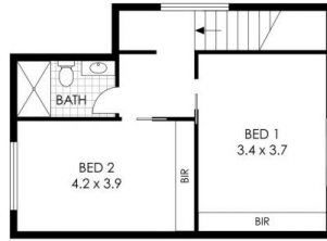
FIRST FLOOR (RESIDENCE 1)